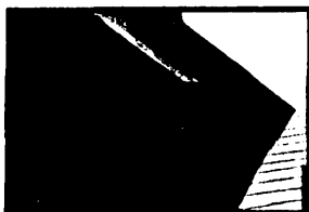
SOUTH EAVE DETAIL