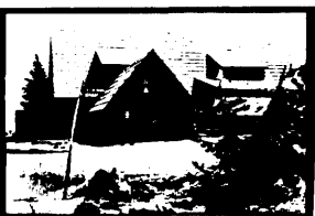
SOUTH ELEV. 8-3-84