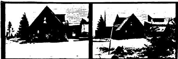
SOUTH ELEV. 8-3-84