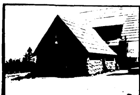
S-EAST ELEV. 8-3-84