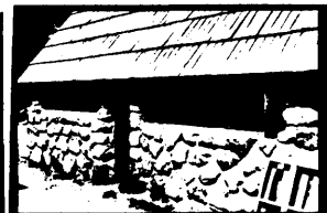
EAST ELEV. 8-3-84