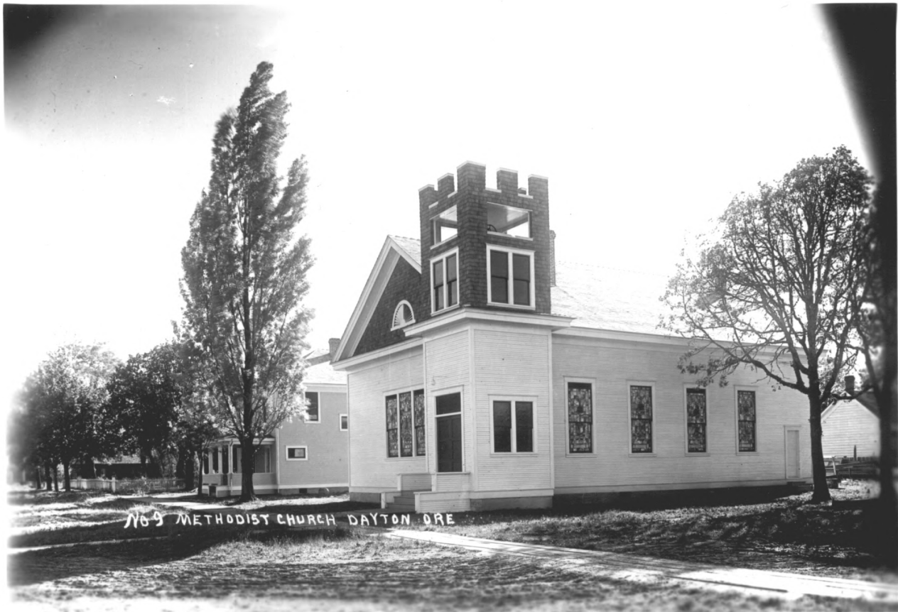
No. 9 METHODIST CHURCH DAYTON ORE