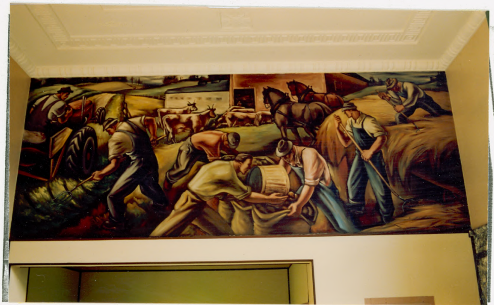
MURAL NORTH END OF LOBBY