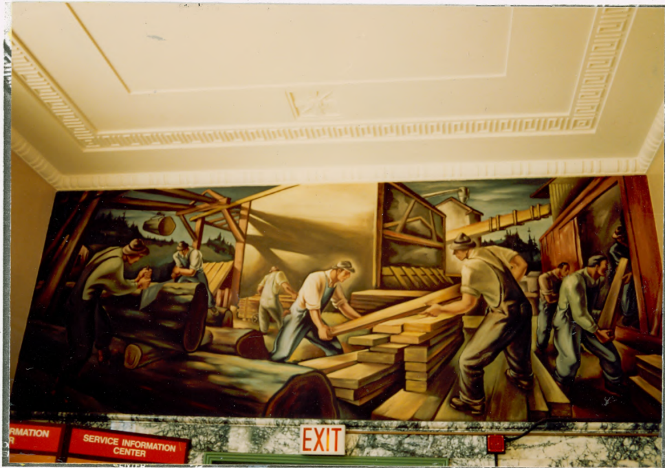
MURAL SOUTH END OF LOBBY