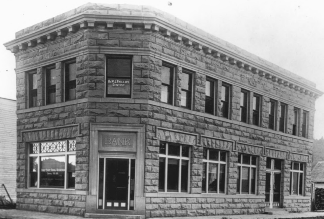
N.W. BANK BLDG. SUTHERLIN, ORE.