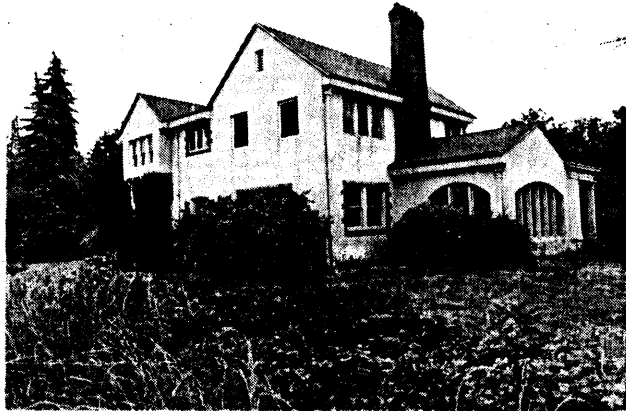
BOSWORTH, RALPH LYMAN, HOUSE

UNDATED PHOTOGRAPH SHOWING HOUSE ON ORIGINAL SITE AT 1109 NW 9th STREET, CORVALLIS, BENTON COUNTY, OREGON