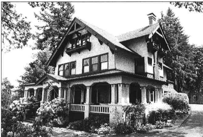
Photo 2 of 21: OR_MarionCounty_LouisAdamsHouse_0002 North (left) and west (right) elevations, view to the east.