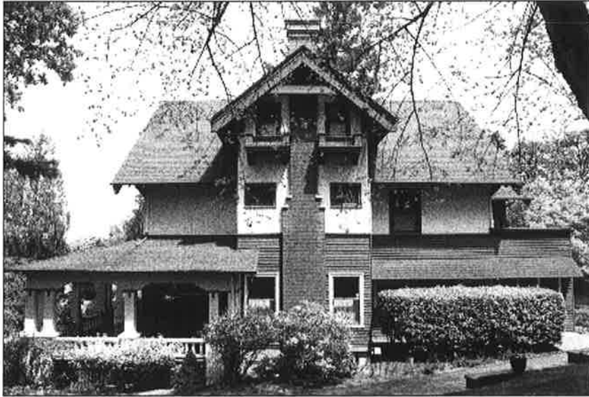
Photo 5 of 21: OR_MarionCounty_LouisAdamsHouse_0005 West elevation, view to the northeast.