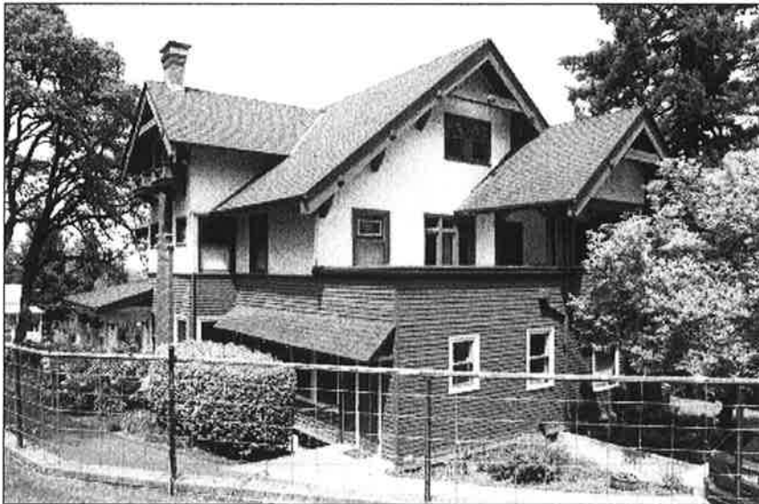
Photo 4 of 21: OR_MarionCounty_LouisAdamsHouse_0004 West (left) and south (right) elevations, view to the north.