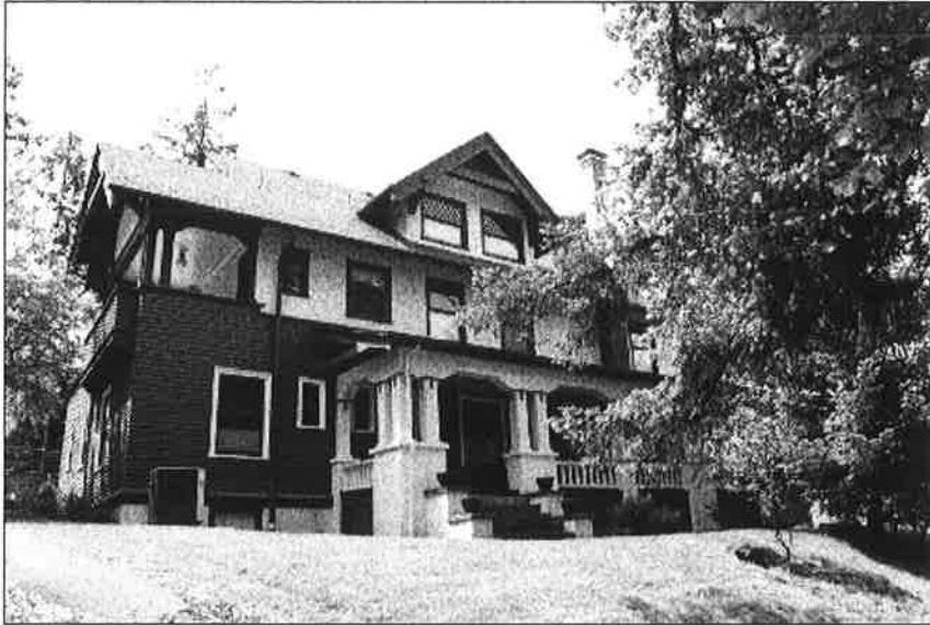
Photo 3 of 21: OR_MarionCounty_LouisAdamsHouse_0003 East elevation, view to the west-northwest.