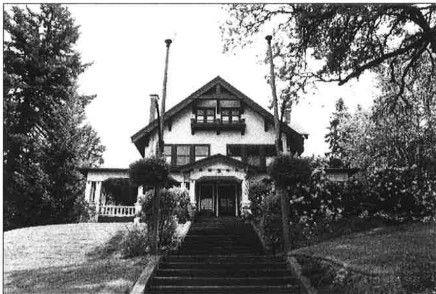
Photo 1 of 21: OR_MarionCounty_LouisAdamsHouse_0001 North (principal) elevation, view to the southeast.