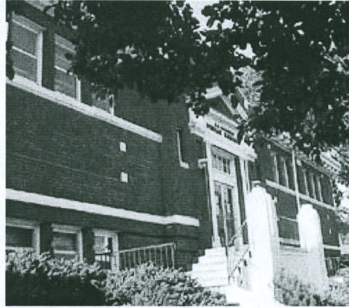
HISTORIC CARNEGIE LIBRARY BUILDING

On September 19, 2006, the La Grande Public Library moved from its old quarters in the Old Historic Carnegie building to a new building, christened the F. Maxine and Thomas W. Cook Memorial Library, at 2006 Fourth Street.