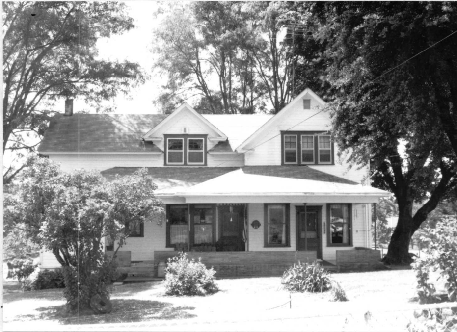
Figure 3. Photograph