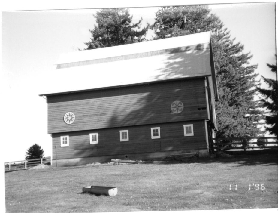
B-61, West elevation. (Photograph: roll 25, frame 16)