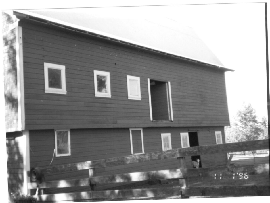
B-61, East elevation. Note the loft level door. (Photograph: roll 25, frame 17)