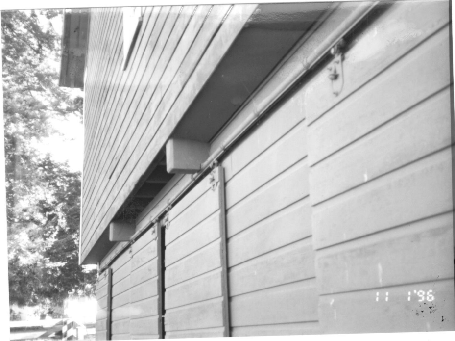
B-61, Detail of overhang on the north elevation. (Photograph: roll 25, frame 15)