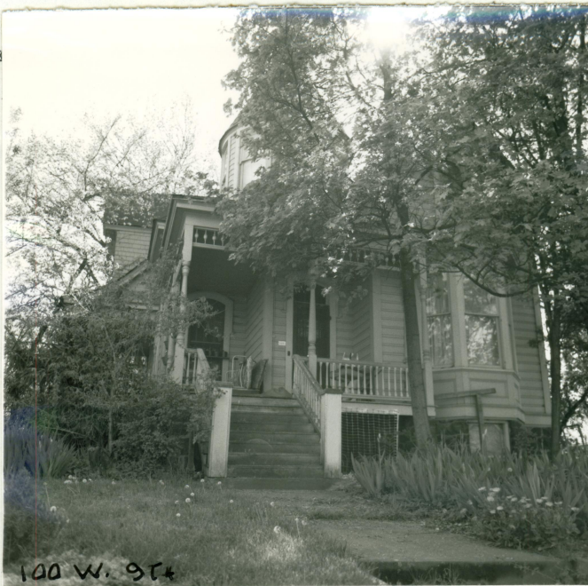
***** 100 W. 9th *****

***** Historic Name: Hugh Glenn House * * * Common Name: Bennett House * * * Address: 100 W. Ninth St. * The Dalles, Oregon * * Owner: Dorothy B. West * * * Address: 100 W. 9th St. * The Dalles, OR 97058 * * Lot 1&2 Block 26 * Addition Gates * Flat _____ ***** Tax Lot 400, 1N-13-4DA