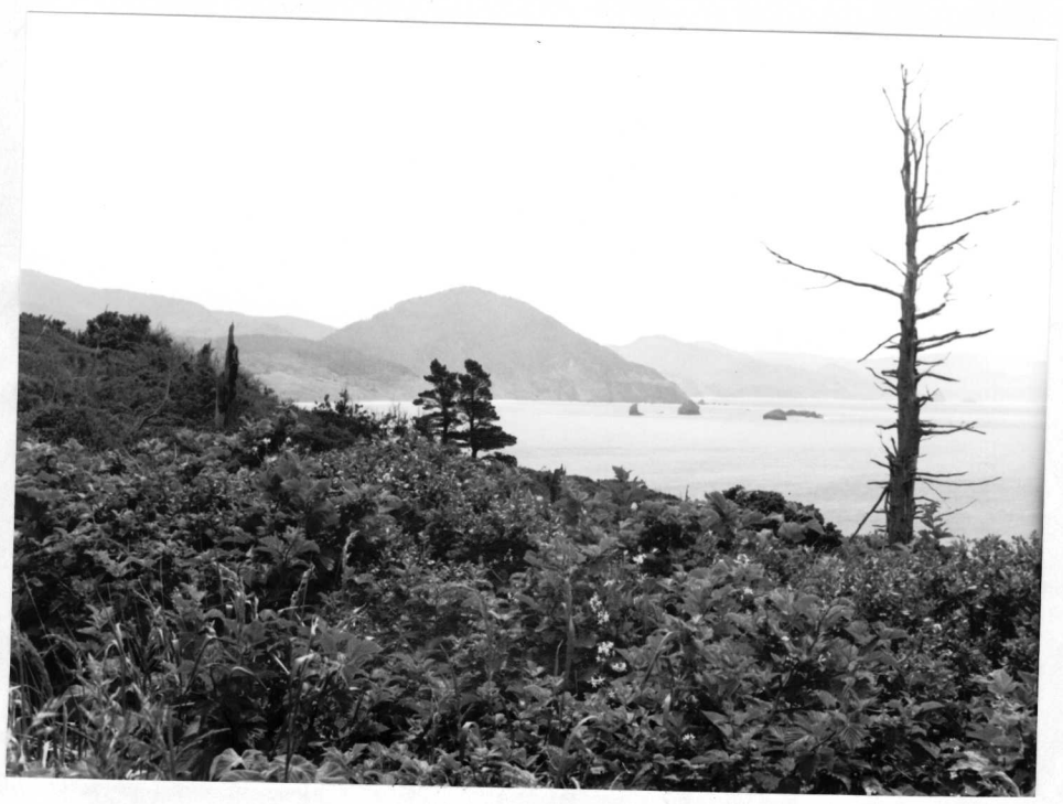
Humbug Mountain from Port Orford Heads