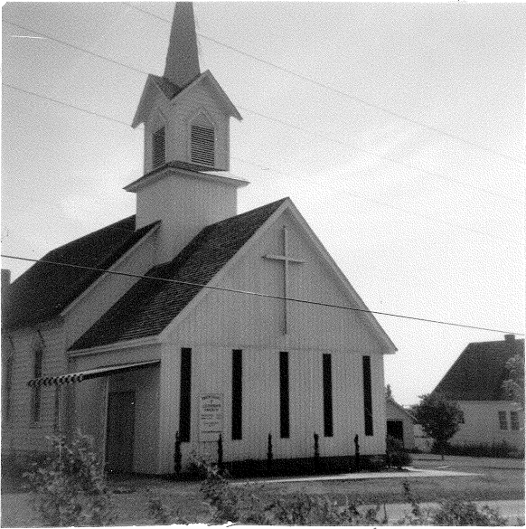
Macksburg Lutheran Church 1966

County Clackamas Theme _____ Name (Common) Macksburg Lutheran Church (Historic) Same Address 10210 S. Macksburg Road Canby, Oregon 97013 Present Owner Macksburg Lutheran Church Address 10210 S. Macksburg Road, Canby, Ore. 97013 Original Use Church Services Date of Construction 1892 - 1894