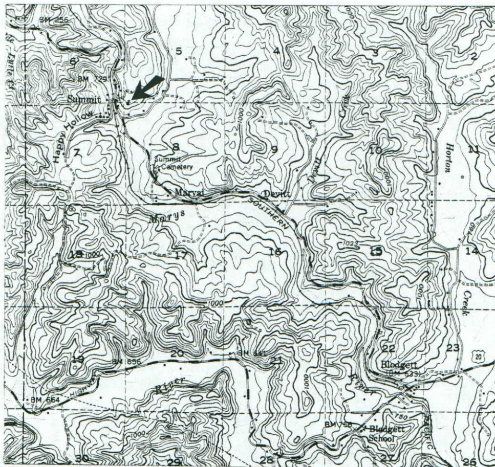
MARYS PEAK QUADRANGLE