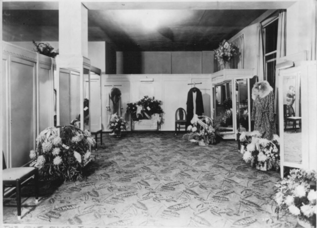
THE COAT SHOP - THIRD FLOOR