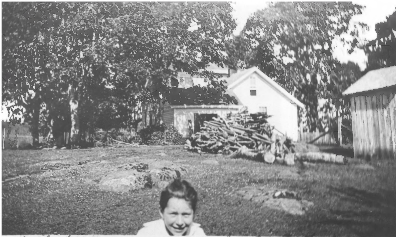
Wellida near rear of Ohmar house