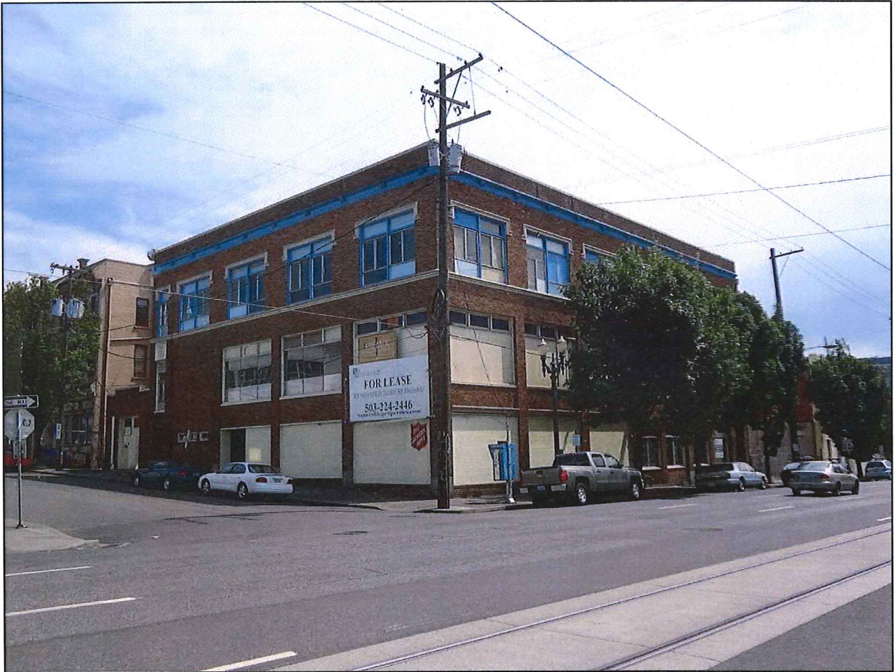
Salvation Army Industrial Home building, northwest corner, looking southeast