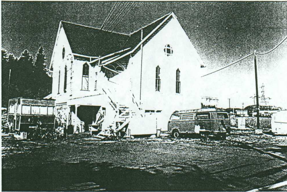
Figure HS1-1.1 Goshen Church of Christ, front, view to west.