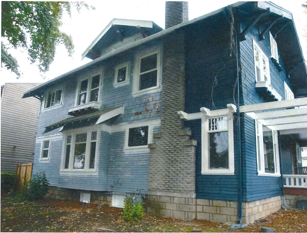
Foster House, west side elevation viewed from Mill Street.