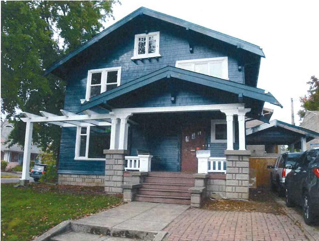
Foster House, front (south) elevation looking north from E. 13 th Avenue.