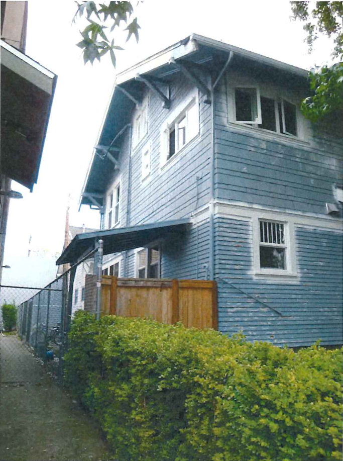
Foster House, north (rear) and west side elevations viewed from Mill Street.