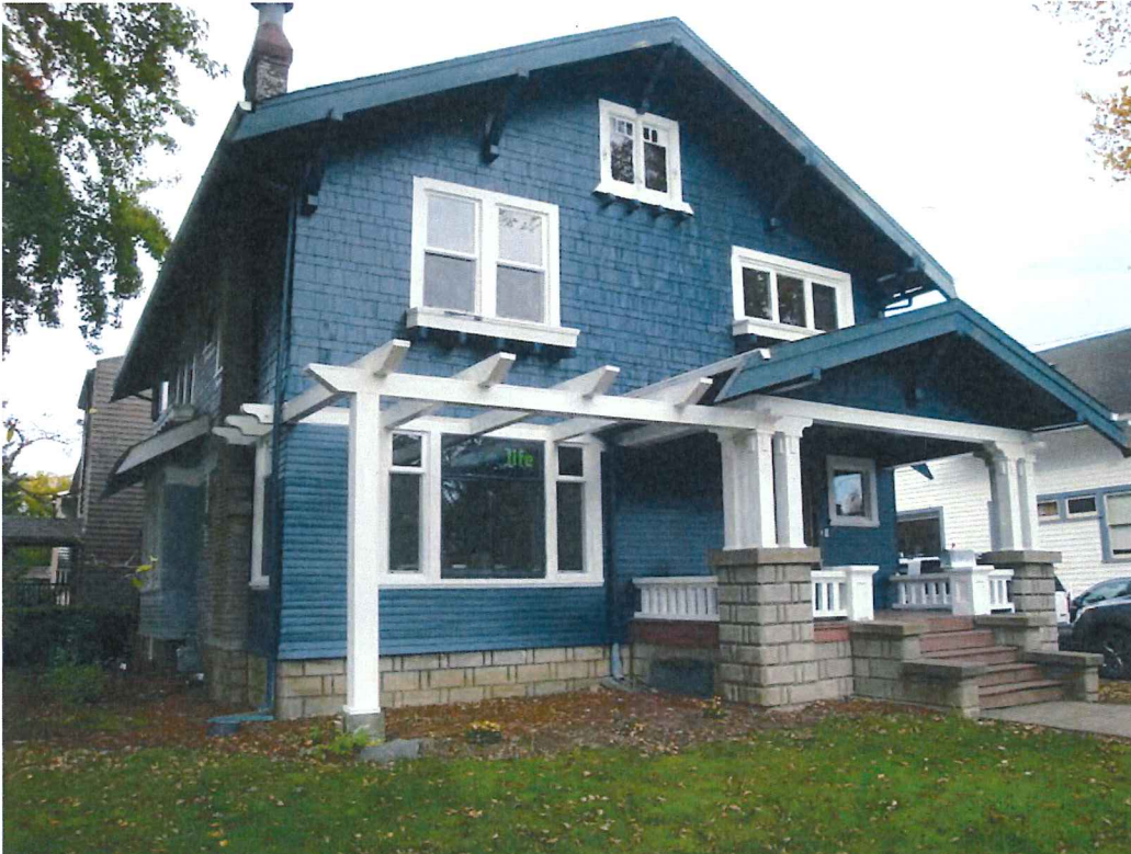
Foster House, front (south) elevation looking northeast from corner of E. 13 th Avenue and Mill Street.