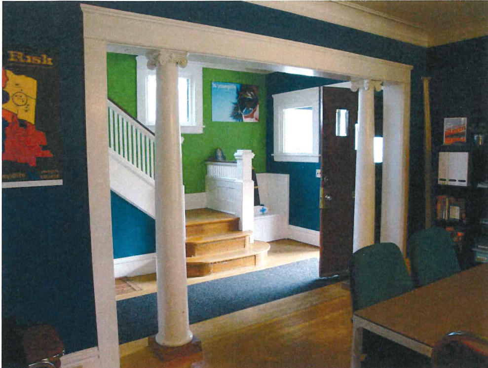
Foster House, view from living room into entry with open front entrance door.