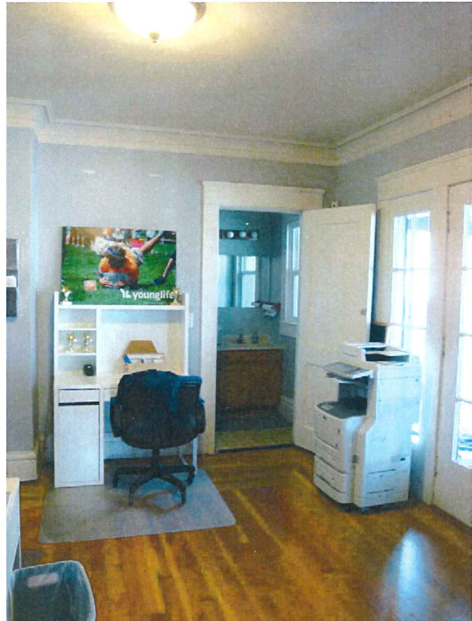
Foster House, office/den; french doors to porte cochere at rt.