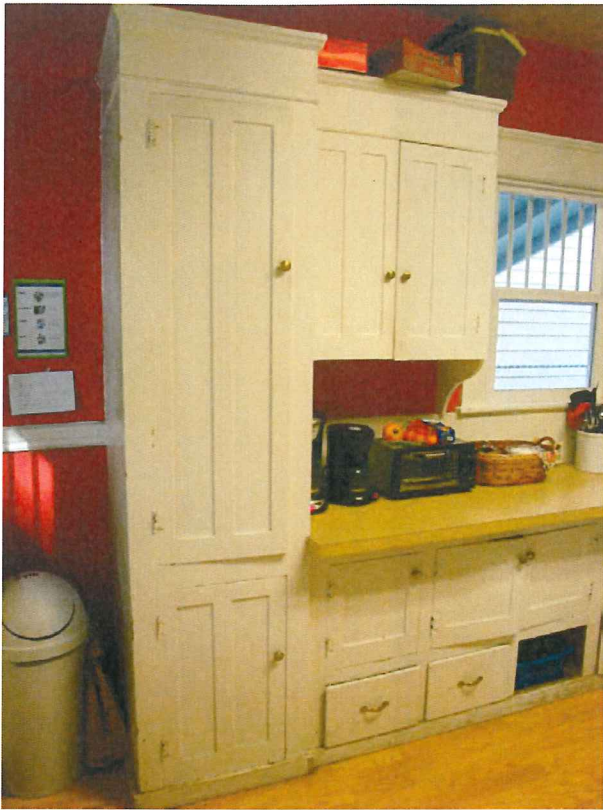
Foster House, original kitchen cabinetry.