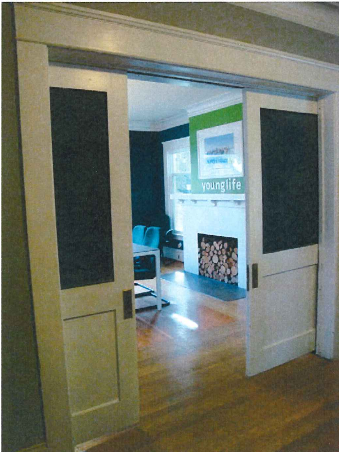
Foster House, view from dining room into living room.