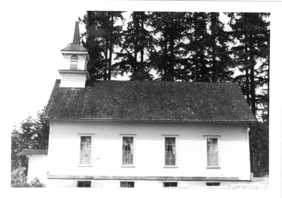
View to north