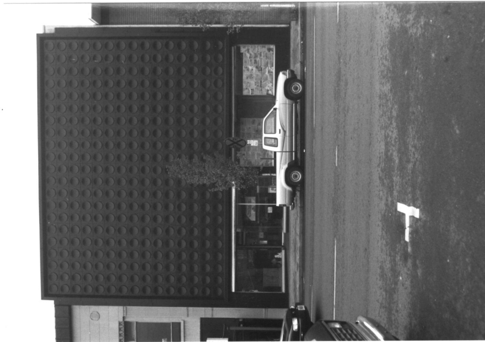
[Vertical Photo mounted in Horizontal Orientation]

Common: Fashionette Building Date of Construction: c1886