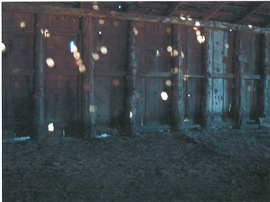
View: Exterior wall construction from interior of barn