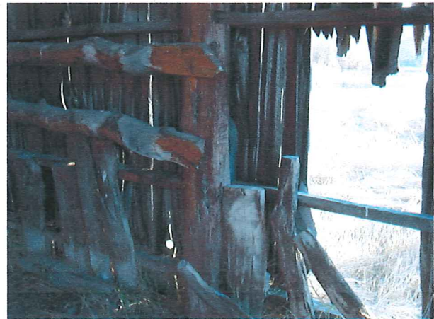
Missing board and batt on west side exterior wall.