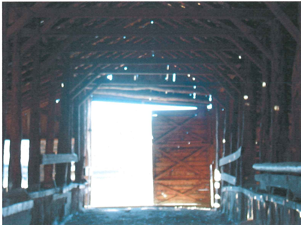
View : North side of barn through center aisle. Off set of door shows amount of subsidence of northeast corner of barn.