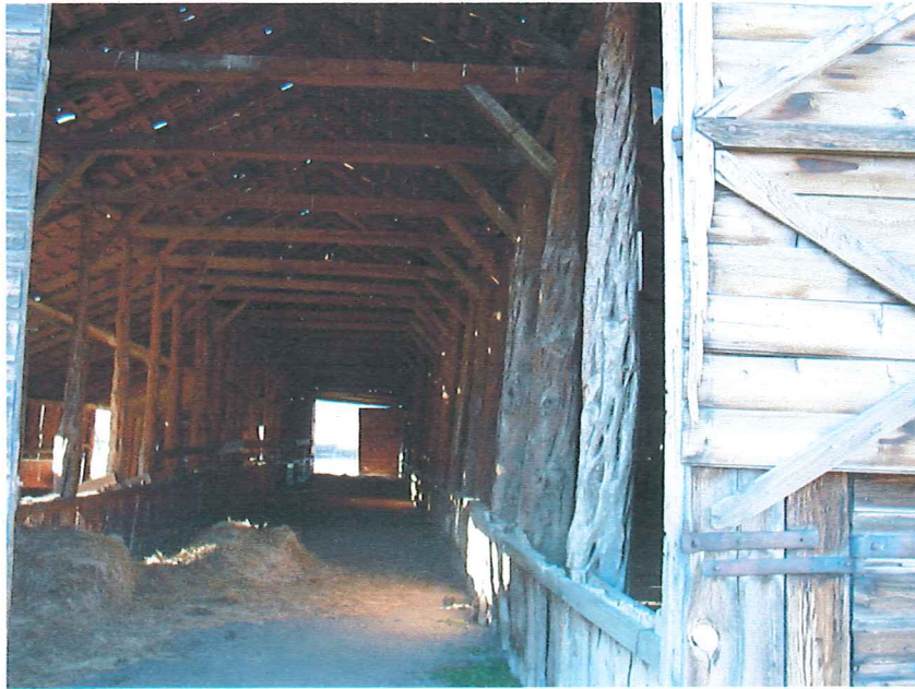
View: Center aisle of P Ranch Long Barn, looking north

City, County: ?Frenchglen, Harney County