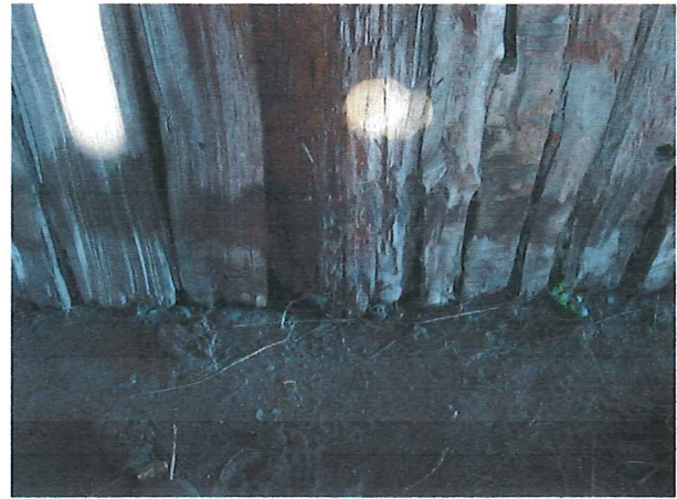
Rot at base of juniper post, center aisle