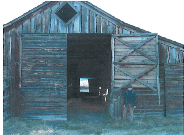
South side of barn, doors and center aisle.