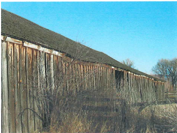
Uneven roof line, west side.