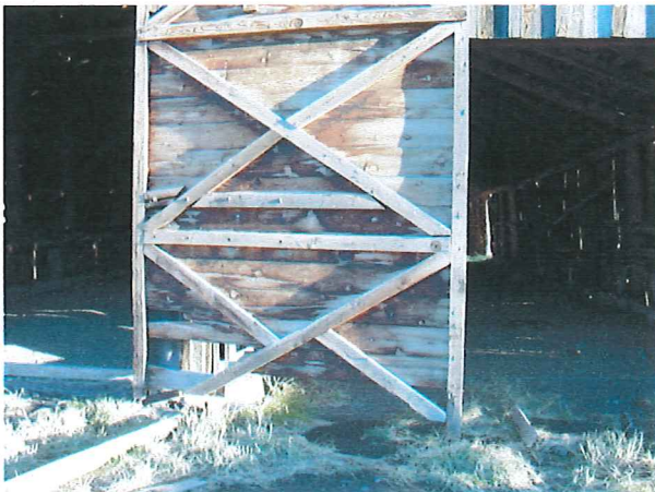
Deteriorated condition of south door.