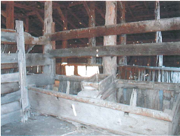
Feed racks in manger, west side of barn

City, County: ?Frenchglen, Harney County