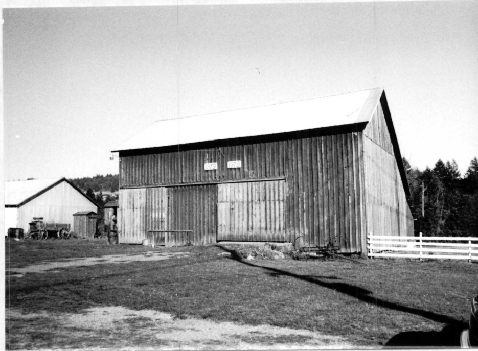
BARN SHPO 503

DATE BUILT: 1879 STYLE: Western PLAN TYPE/SHAPE: Rectangular NO. OF STORIES: 2 FOUNDATION MATERIAL: Unknown BASEMENT: None ROOF FORM AND MATERIALS: Gable on hip w/ sheet metal WALL CONSTRUCTION/STRUCTURAL FRAME: Wood/Unknown PRIMARY WINDOW TYPE: None EXTERIOR SURFACING MATERIALS: Board-and-batten DECORATIVE FEATURES: Diamond gable-end window opening, s. elev. OTHER: Side-wall overhead sliding door CONDITION: Good EXTERIOR ALTERATIONS (DATE): None apparent